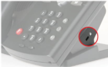
SoundPoint IP Phones